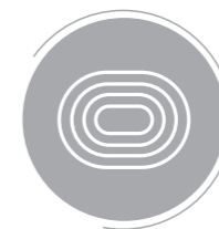
TRACK AND FIELD