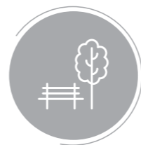
PLAYGROUNDS & PUBLIC AREAS