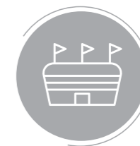
EVENT AND SPORT AREAS