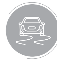
HIGH FRICTION SURFACES